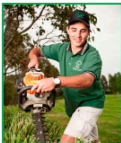
Horticulture – Parks and Gardens