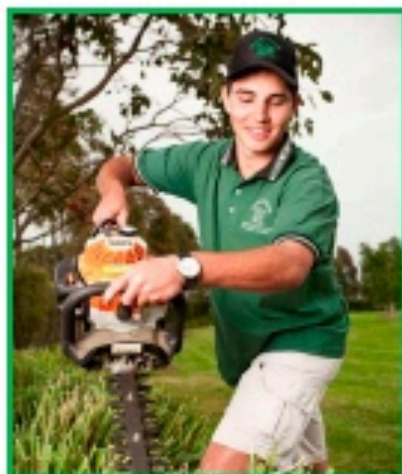
Horticulture – Parks and Gardens