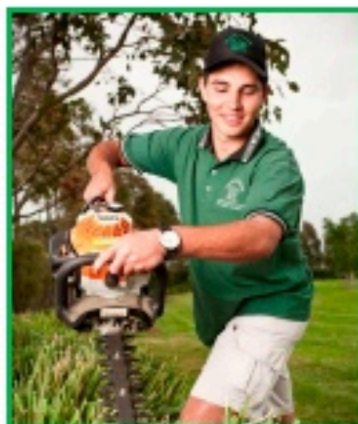
Horticulture – Parks and Gardens