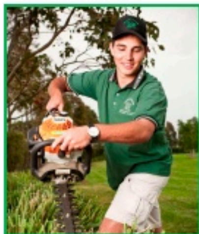
Horticulture – Parks and Gardens